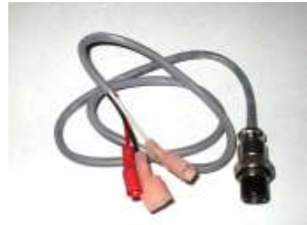
ECMotor Controller Power Cable

A two-foot Power Cable Assembly with “faston” connectors on one end, and a four-pin connector on the other. The four-pin connector matches the power connector on the ECMotor Controller case.