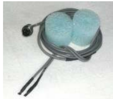
The TDS Sensors