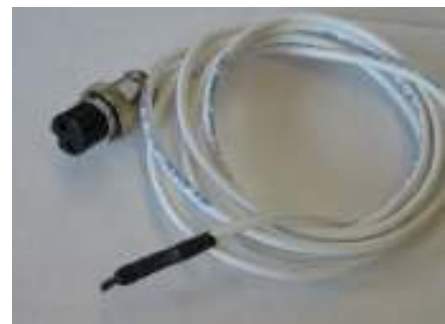
The Ice Sensor