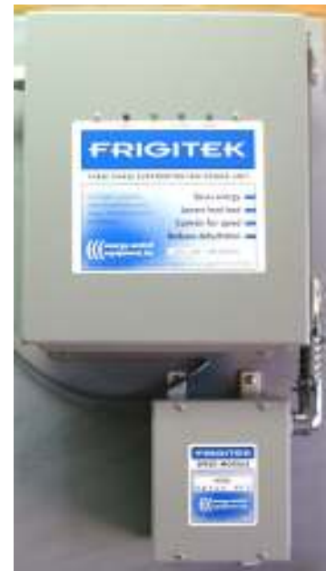
Power Unit Assembly

Verband der Elektrotechnik, Elektronik und Informationstechnik (VDE)